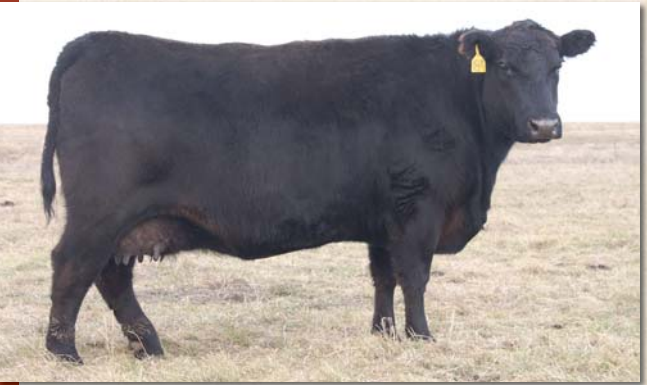
Lot 52 - JLS Madame Pride 7430