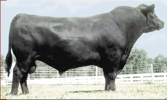
Leachman Right Time - #11750711